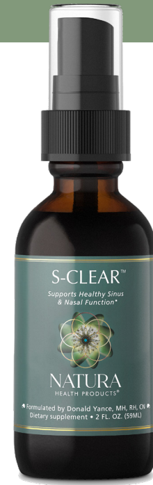
New bottle rollout expected 2022

S-Clear™ features botanical extracts that address nasal and sinus challenges by supporting a healthy immune system and modulating the inflammatory response function of mucous membranes. It also promotes healthy mucous membranes by encouraging proper drainage of mucus and lymph. The vapors from the essential oils in S-Clear™ can offer immediate relief by opening nasal passages. In addition, S-Clear™ helps to maintain a healthy microbial balance in the body.*